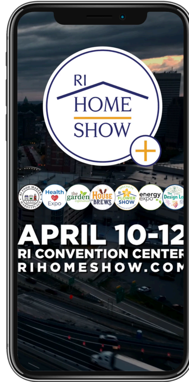
Exhibitor Promo Reel