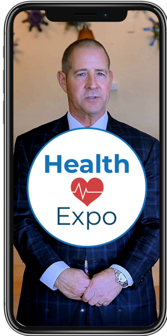
Health Expo Promo Reel