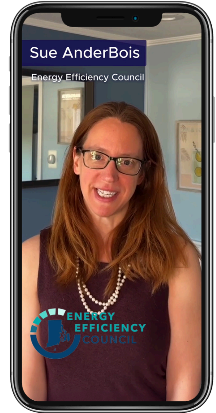
Energy Expo Promo Reel