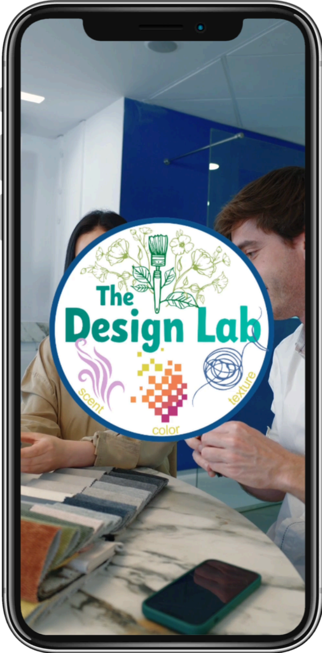
The Design Lab Promo Reel