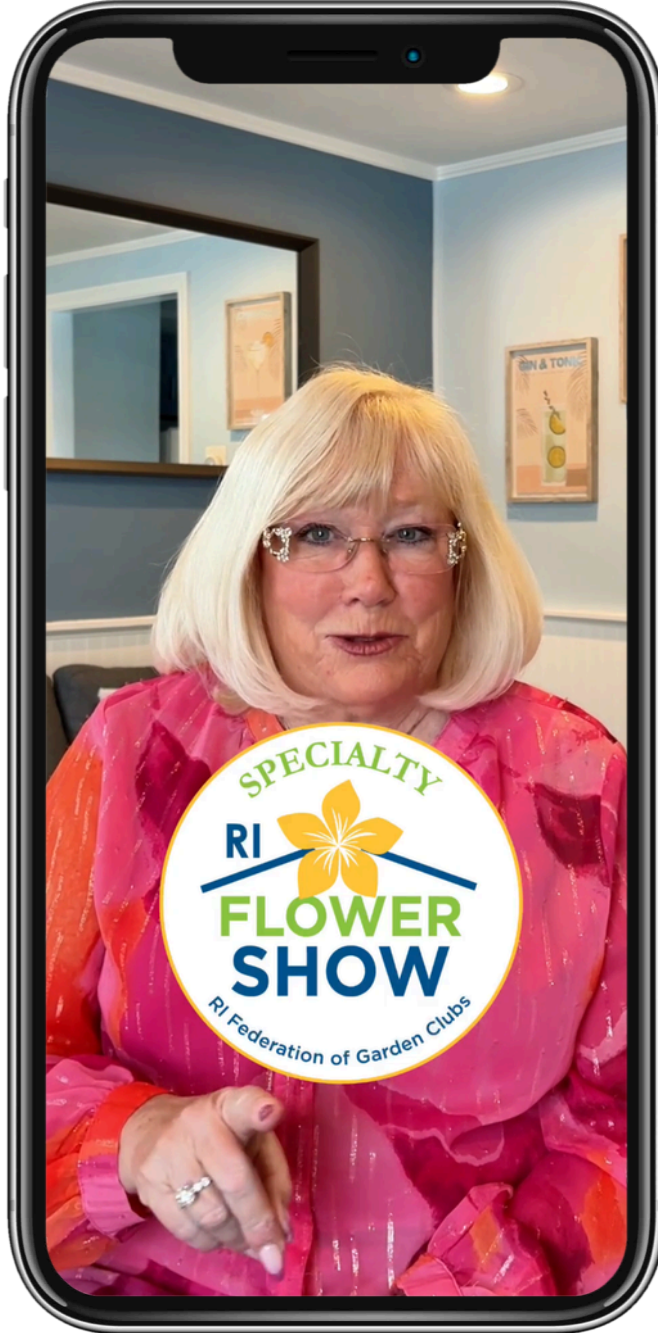
Specialty Flower Show Promo Reel