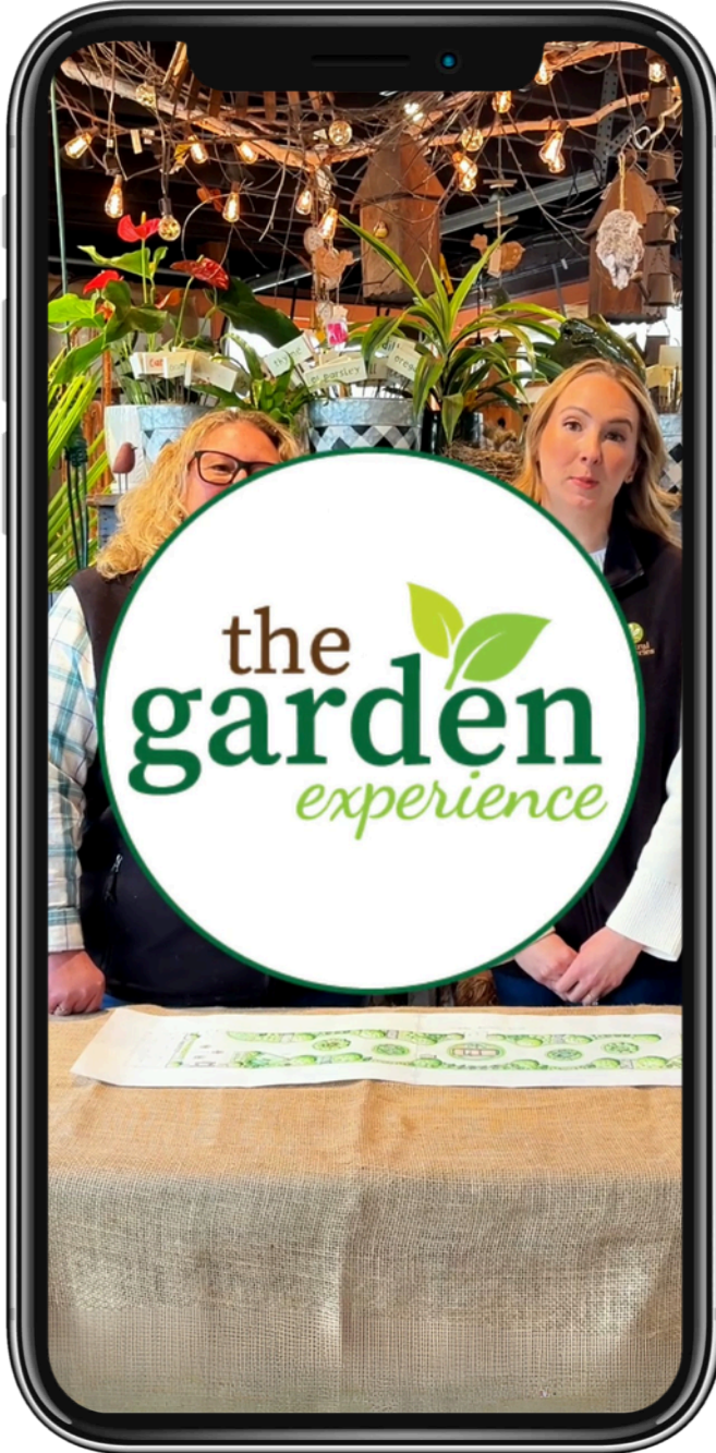
The Garden Experience Promo Reel