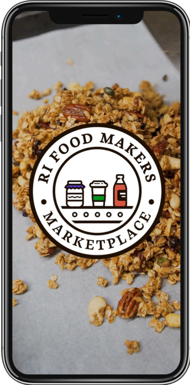
RI Food Makers Marketplace Promo Reel

Click the link below, this will direct you to the reel on our Facebook page to share.